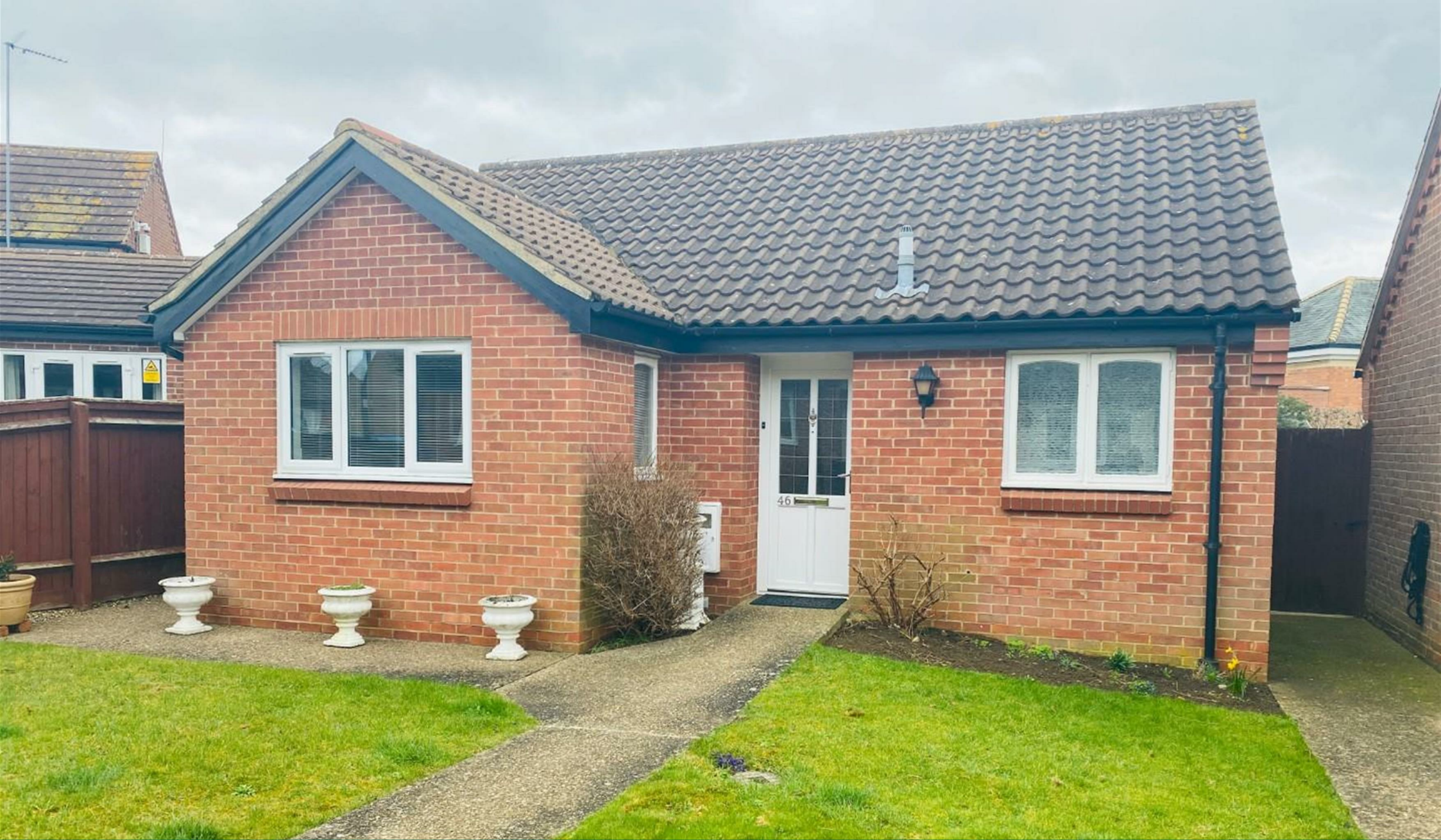
46 Sheraton Close The Headlands, Northampton